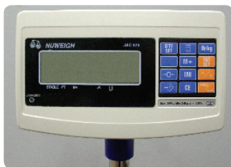
Easy to read and operate indicator

* If scale is NSC certified for trade use * accuracy applies. ** A platform size of 300mm x 400mm is also available.